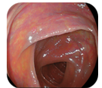
Colon - LCI