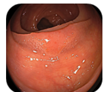
Colon - White Light