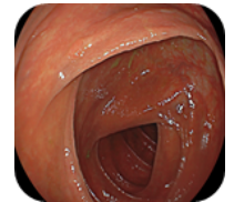
Colon - White Light